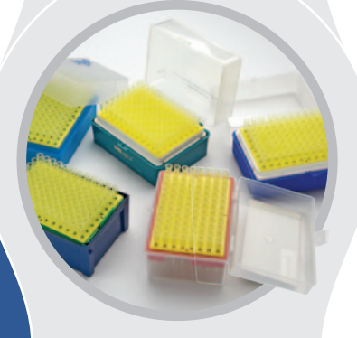
Reloads not only original but also many most popular brands of pipette tip racks