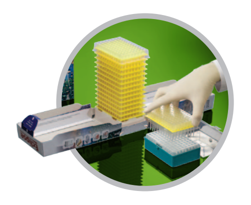
Align Snapload<sup>™</sup> transfer top over refillable rack and place onto rack.