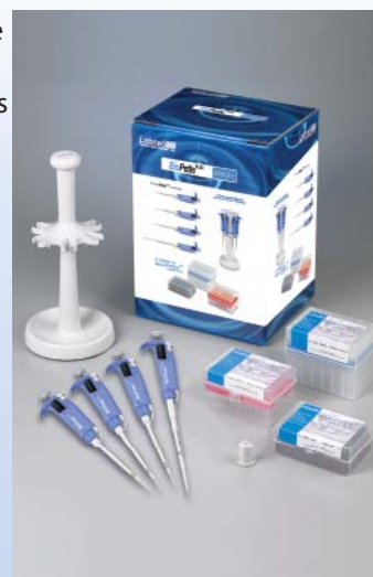
BioPette Plus Four Pack