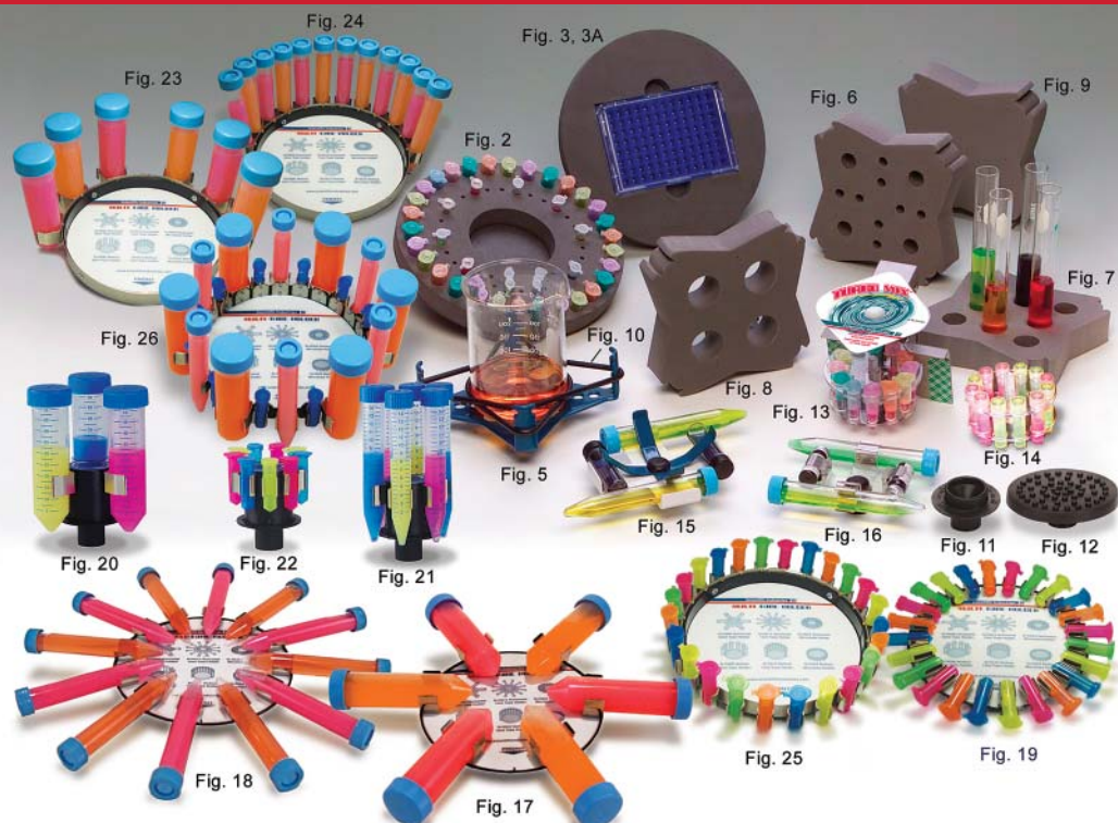
Fig. 1 Model H301 Multiple Sample Starter Set

Accessories for all Vortex-Genie® 2 mixers and Vortex-Genie® Pulse