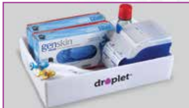
Use for storage or transport of laboratory products