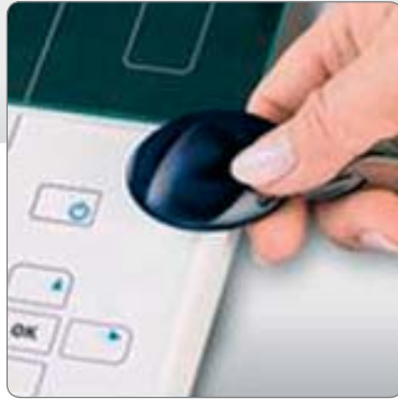
User recognition with electronic ID card