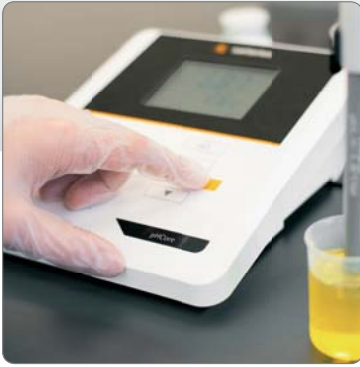
Easy to use interface