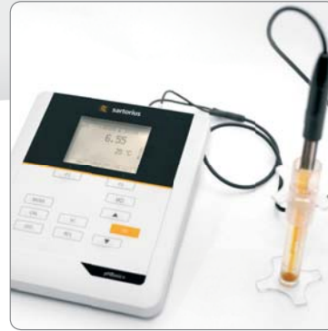
Variety of kits designed with unique electrodes that fit your sample applications needs.