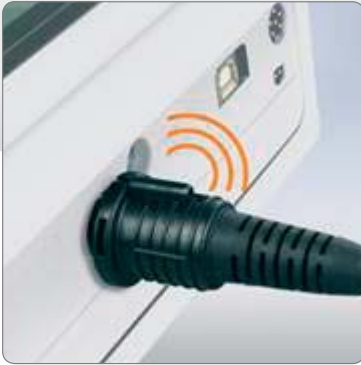
Automatic wireless sensor recognition