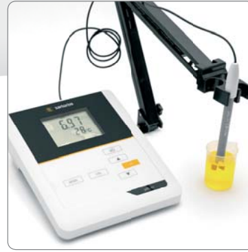
Keep it simple with the core essentials.