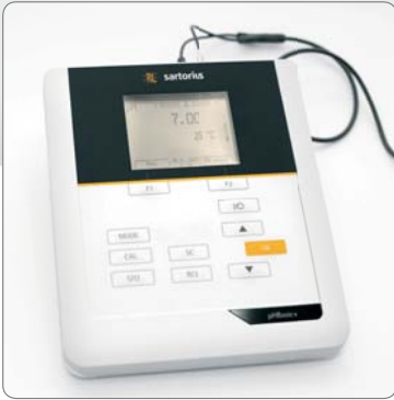
Simple keypad and user friendly navigation screen