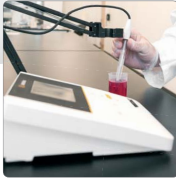
Streamlined profile with data export options