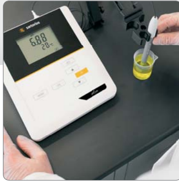
Better results with auto reading stability control indicators