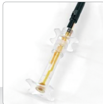
Ready to go storage vessel. Reduces refilling when storing overnight or longer periods. Keeps electrode sensor membrane hydrated at all times.