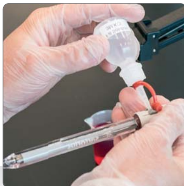
Innovative evaporation gate. Insert, press and refill internal chamber. Gate mitigates constant need to refill electrolyte and protects from secondary contamination.