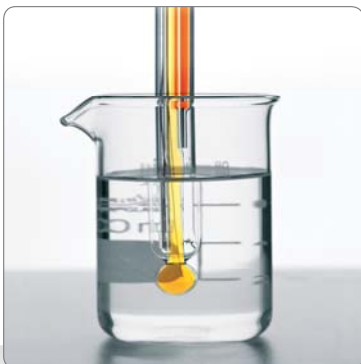
Superior construction, materials and design when it come to body style, sensor shape and reference systems. Diverse selections to meet your unique sample types.