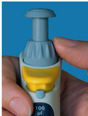
Easy thumb-tip volume setting