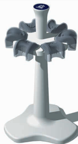
Carousel stand for handy storage of up to six Transferpette® S single or multichannel pipettes