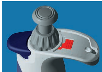
Red recalibration flag indicates adjustment from factory specifications