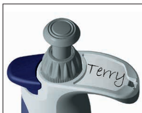
Covered nameplate—identifies pipettes without messy tape!

Tip cone design offers excellent fit with BRAND tips and broadest compatibility with tips from other manufacturers.