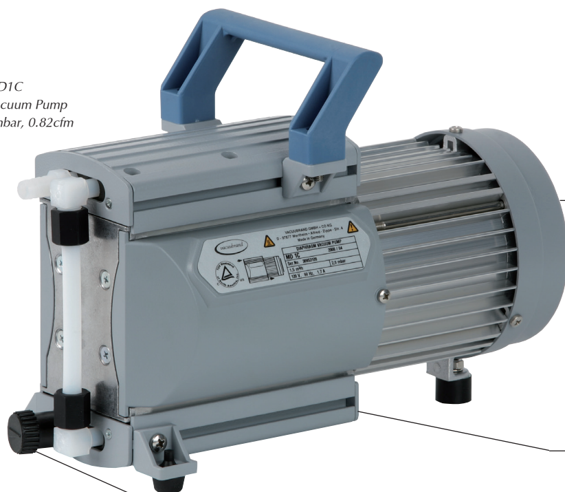
MD1C Vacuum Pump 2mbar, 0.82cfm

Totally dry, there's no oil to change or monitor! Typical diaphragm lifetimes are in excess of 15,000 hours of use—that's years in most applications, so there is very little downtime and low service costs. When it is finally time for service, precision diaphragms eliminate tedious, trial-and-error stroke length recalibration.